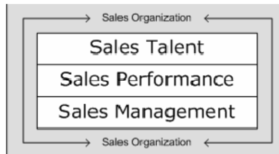
Figure 2: Sales Operational Components

Furthermore, they want to know they have the support of the management team and the necessary tools and information to get the job done right. The more structured the support, guidance and processes – the better. Keep in mind that most sales people are not eagles, so they require this structured approach. As a result, it is crucial to the sales organization's success that the leadership team provides a systematic approach with an emphasis on: Sales Talent, Sales Performance and Sales Management.